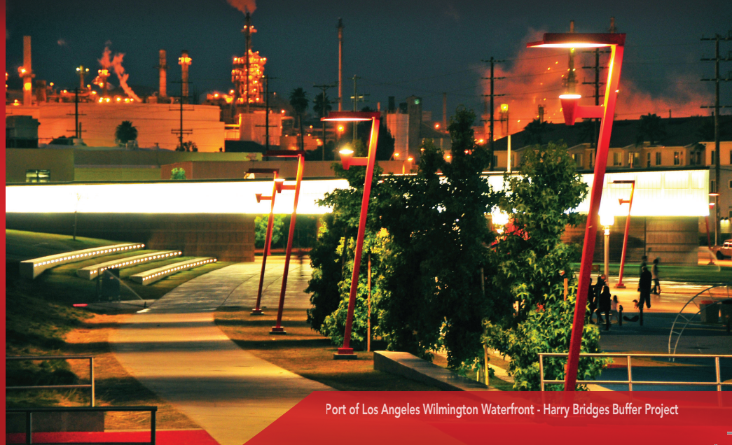
Port of Los Angeles Wilmington Waterfront - Harry Bridges Buffer Project

AWARD SPONSORED BY THE LOS ANGELES COUNTY CHAPTER NATIONAL ELECTRICAL CONTRACTORS ASSOCIATION