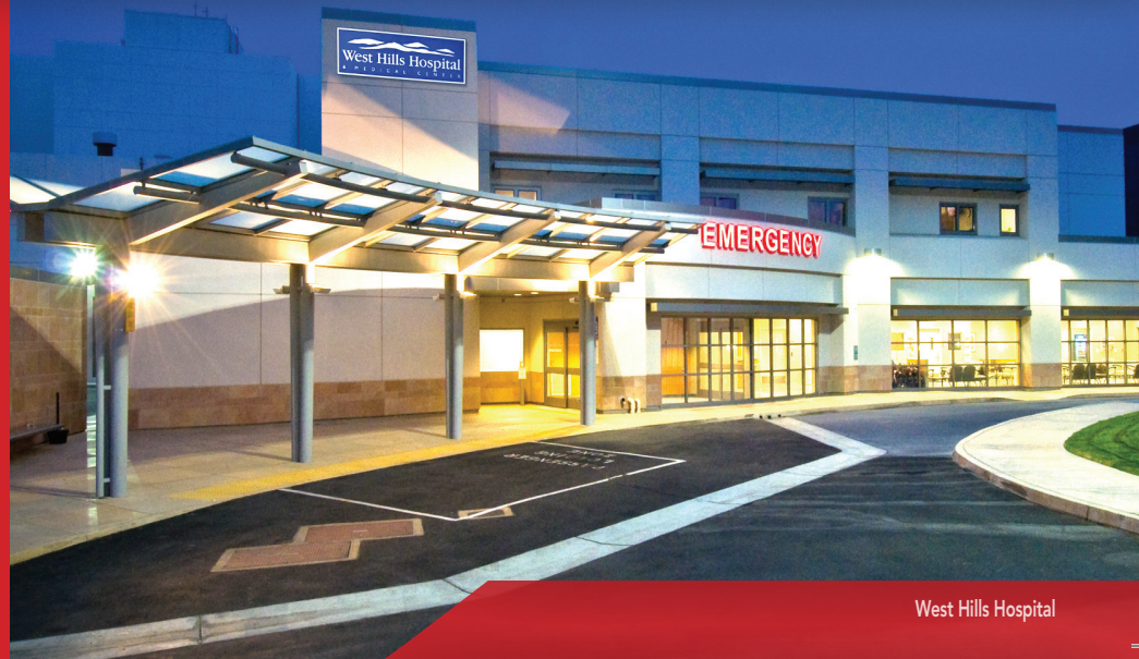
West Hills Hospital

AWARD SPONSORED BY THE LOS ANGELES COUNTY CHAPTER NATIONAL ELECTRICAL CONTRACTORS ASSOCIATION