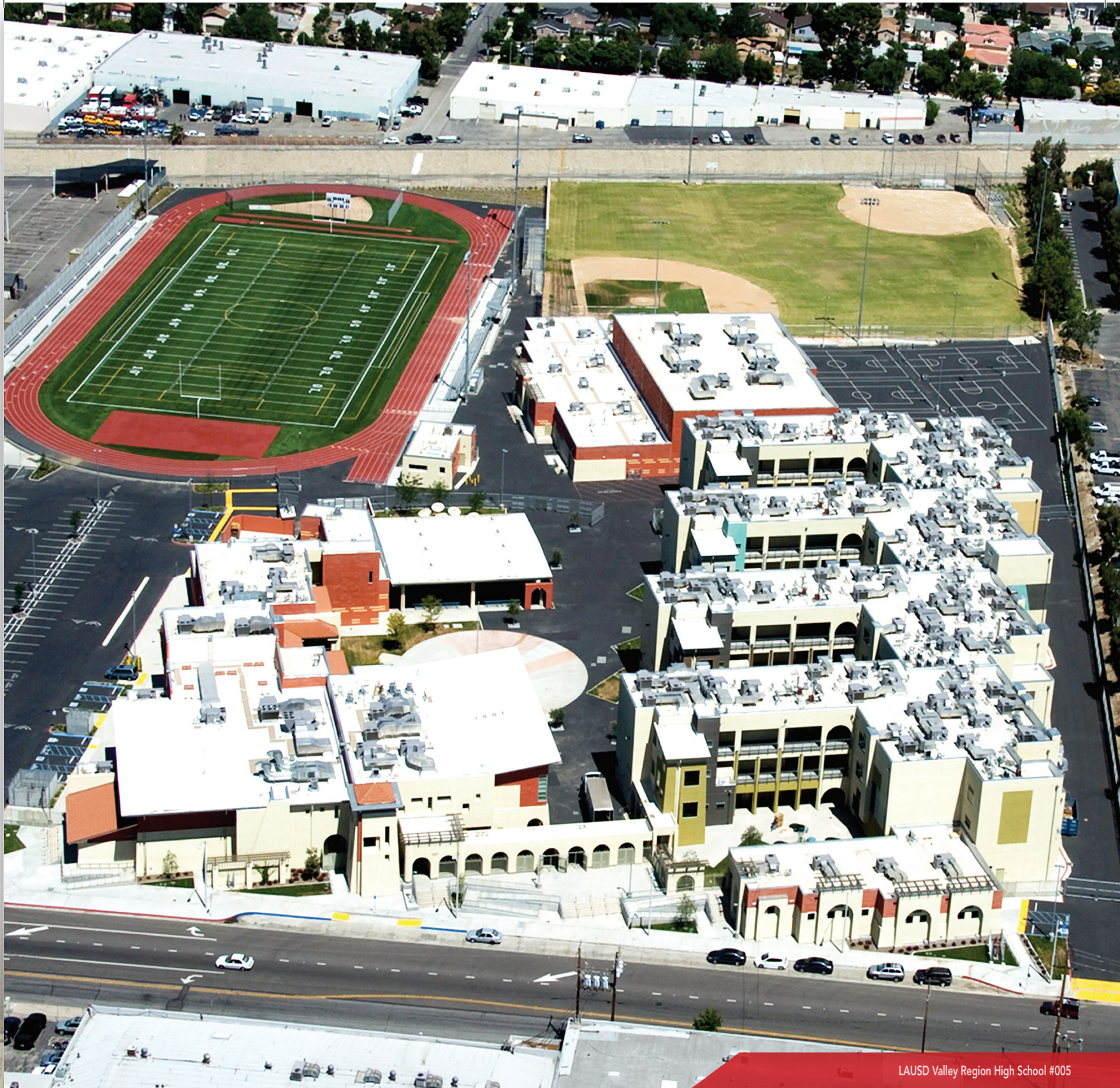
LAUSD Valley Region High School #005