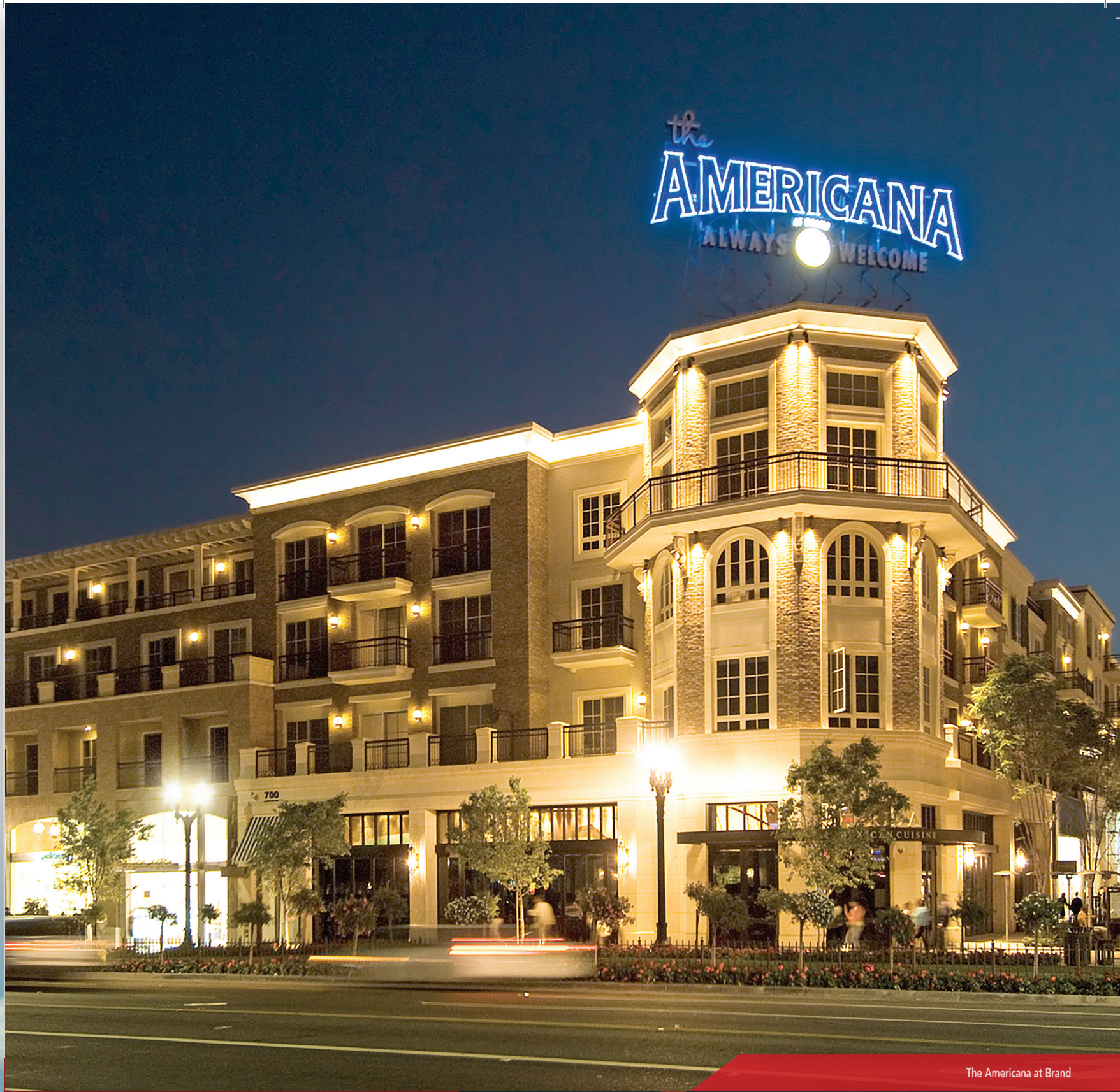
The Americana at Brand